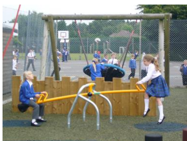
Students of Oakhurst First