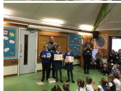
Category 2 (Bottom)