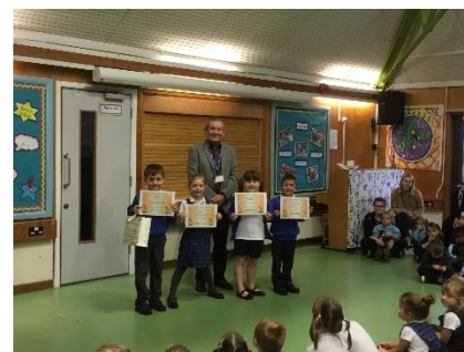
Category 1 (Top)