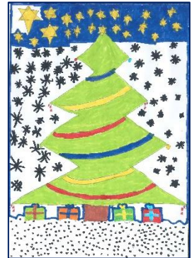
Theo Parrett Runner Up 2