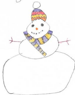
Runner up 2 Brooke Drewett aged 9 1 st West Moors Scouts,