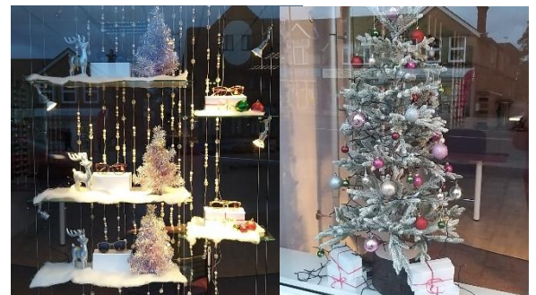
EyeStyle Centre (Above and right)