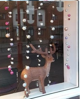
Home Instead Senior Care (Left)