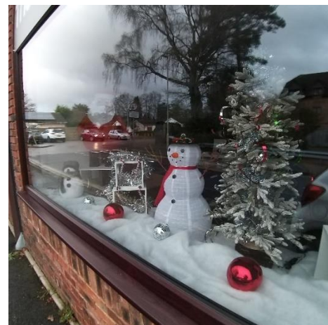
The School Shop (Above) Hamper Prize (Below)