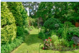
Jacky Stapleton – Winner of Class 4 and 5