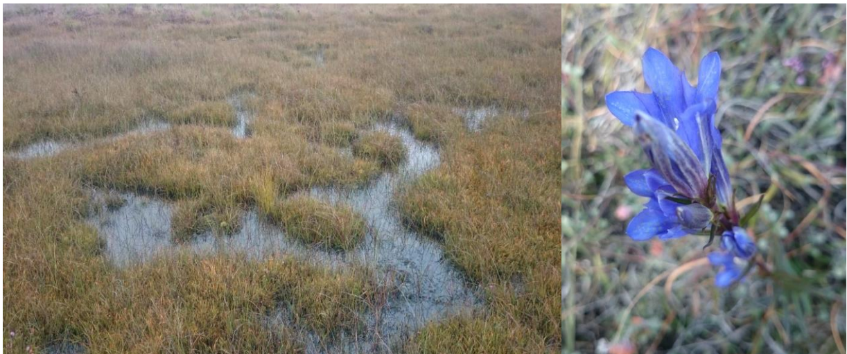
Desirable shallow pools (left) in the mire system which provide a good habitat for the wildlife associated including the delicate marsh gentian (right).

In order to restore the mire we will be installing a series of plugs within the ditch network. This will slow the passage of water running off the heath and encourage it to flow sideways into the mire where it will form desirable shallow pools. The plugs will be a mixture of wooden shuttering and 'peat blocks' from the surrounding mire. In total there will be 56 plugs installed at 50m intervals along approximately 3.50km of ditches. This will contribute to the restoration of around 98 hectares (242 acres) of the mire that is currently degraded.