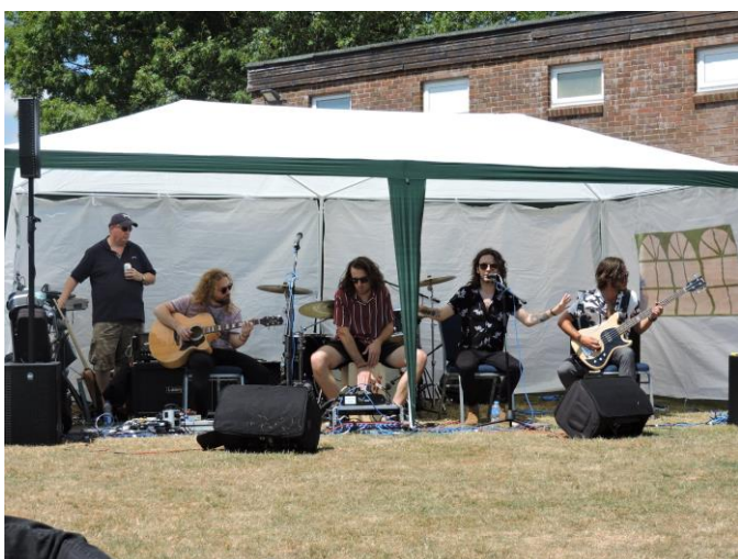
'Our Propaganda' live band.