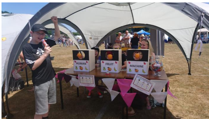
West Moors Parish Council game 'Human Fruit Machine'