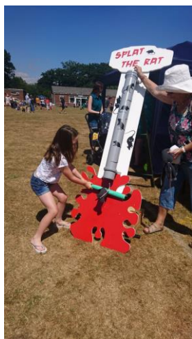
The parish stall provided various games which the children seemed to enjoy. Splat the Rat, Human Fruit Machine, Higher or Lower, skittles, guess the amount of jelly beans and guess the name of the teddy bear.