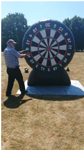
The inflatable darts game was a hit.