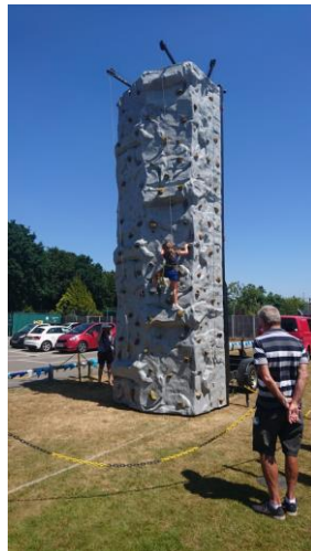
The climbing wall was enjoyed by many.