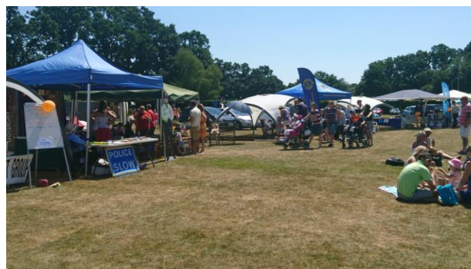
'Sheduction' stall to the left and guests chilling out