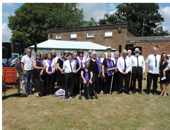
'St. Martin's United Reformed Church Gospel Choir' from West Moors