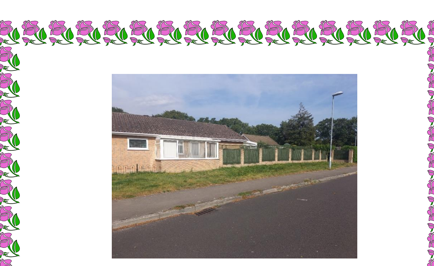
Above and below: Woolslope Rd before Spinners Close.