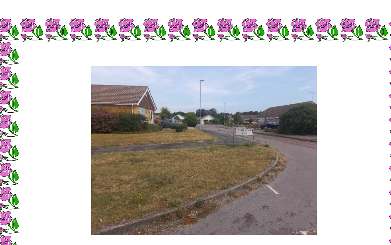
Above: Corner of Heatherdown and Uplands Road