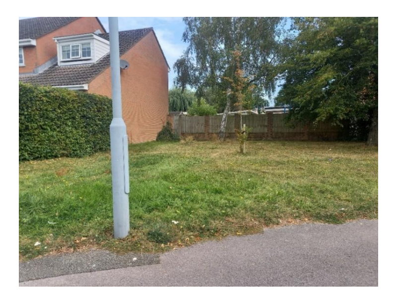
Above: Woolslope Rd before Weavers Close